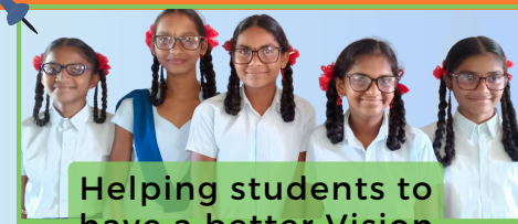
Helping students to have a better Vision

»» Apparently, a large number of children have poor academic performance simply due to poor vision. We examined a total of 1,100 high school students. 243 out of them needed and were supplied with spectacles. Hopefully, this will lighten up their future.