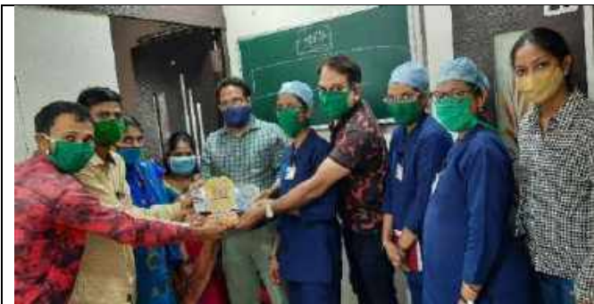
9.1.2021 Mauli samajik sanstha Honouring Team MLDT