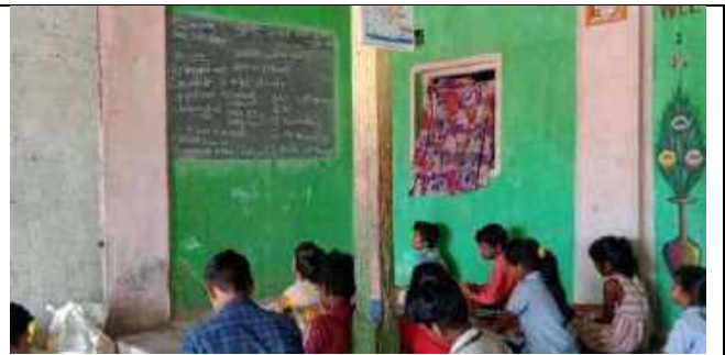
Village Learning Center (VLC-Ghanede )