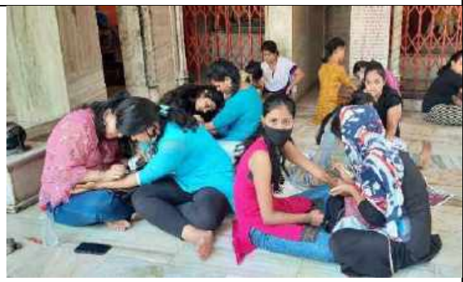
19.3.2021 Rangoli Mehndi competition