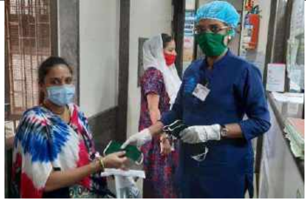
Daan utsav October 2020