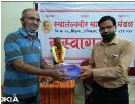
Distribution of medicine with the help of local library and socio cultural organization, Swatantraveer SawarkarMandal by by Masurkar Colony Clinic, Pimpri Chinchwad