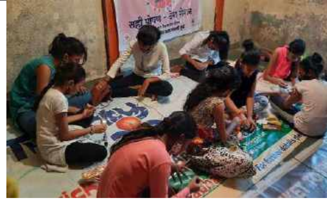
25.3.2021 Nail ART