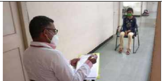
Screening of Covid case at quarantine centers