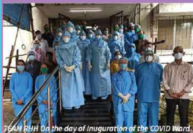
TEAM RHH On the day of Inuguration of the COVID Ward.

Donation to the Trust is exempted u/s 80G