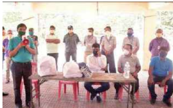
Distribution of Preventive medicine with help of local corporator by Masurkar Colony Clinic, Pimpri Chinchwad