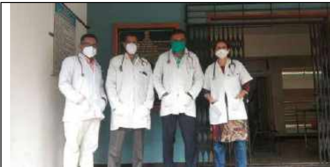
Team of physicians