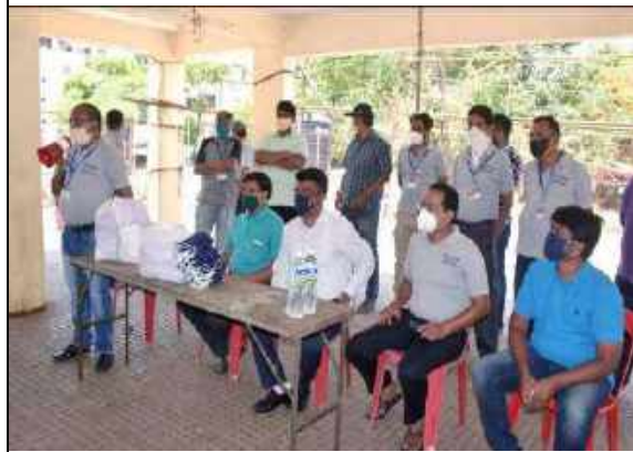
Distribution of Preventive medicine with help of local corporator by Masurkar Colony Clinic, Pimpri Chinchwad