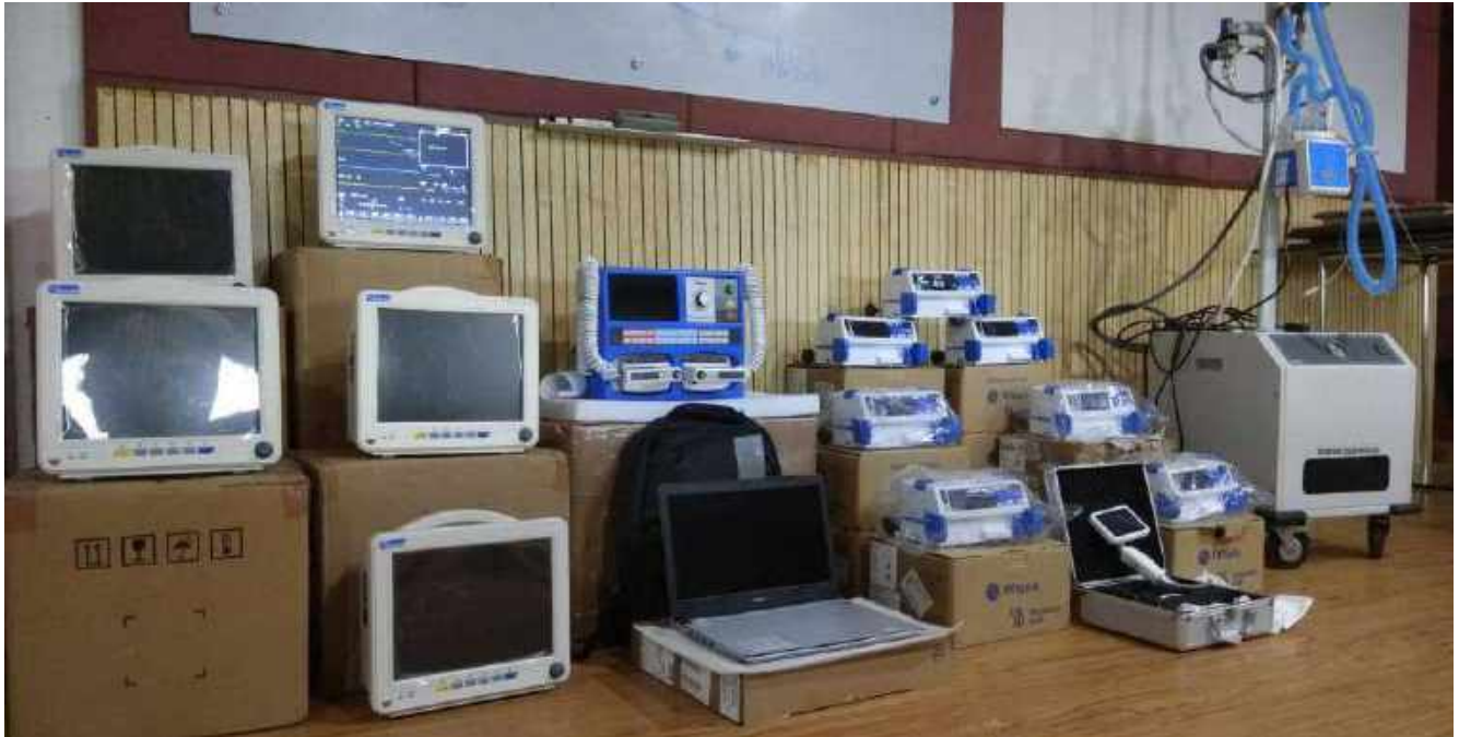
Upgraded Machinery in the Covid Ward