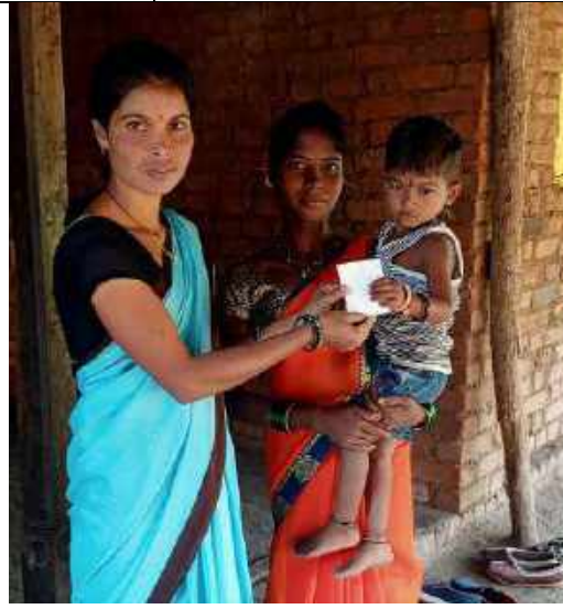
Medicine Distribution in the villages