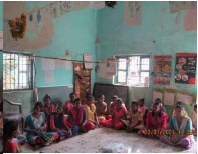
Adolescent Hb Check up Camp