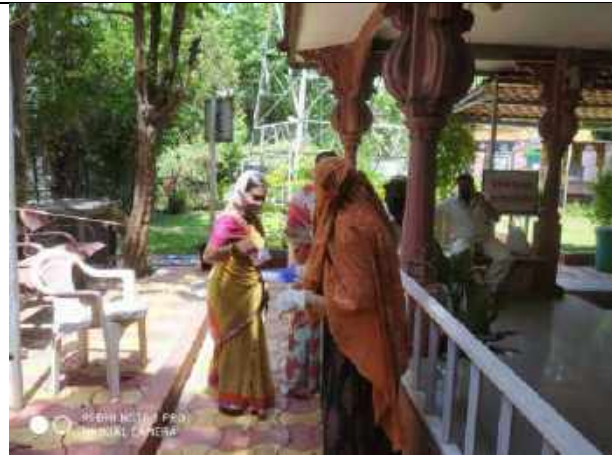
Gururaj Clinic, Kothrud