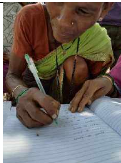
Learning to do the signature