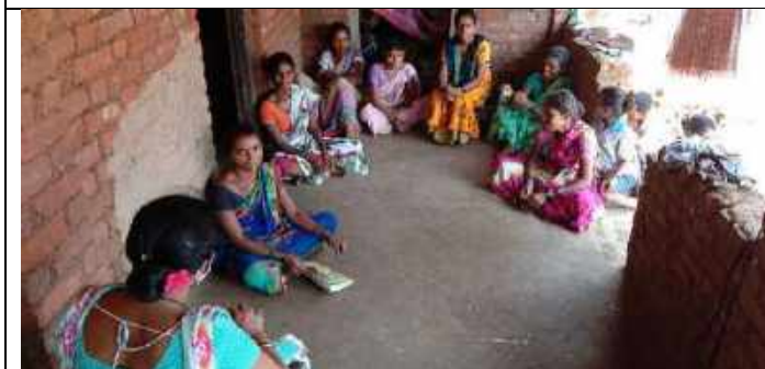
Covid Awareness session 3