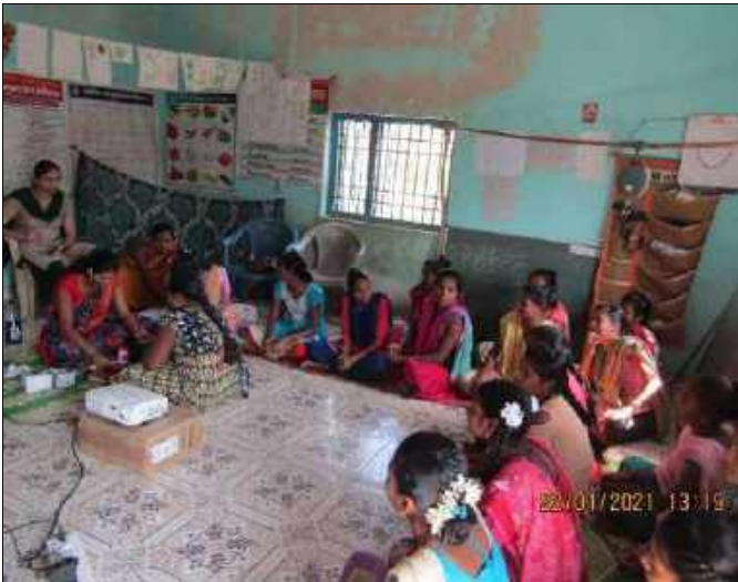
Adolescent Hb Check up Camp