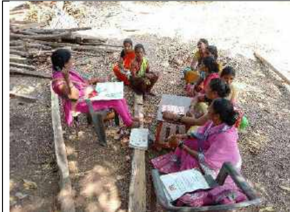
Vaccination Awareness session