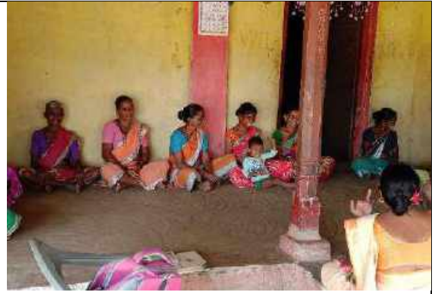
Covid Awareness session 2