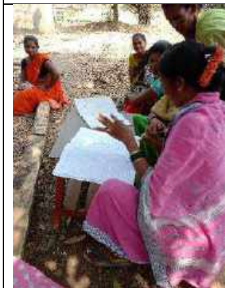
Learning to do the signature