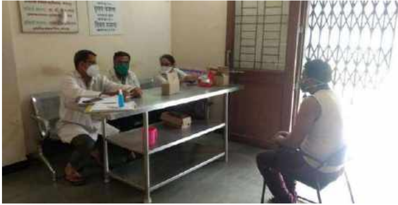
Screening of Covid case at quarantine centers

Names of the quarantine centers screened –