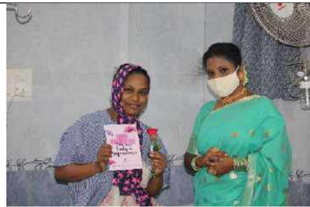
8.3.2021 Women's Day Party Celebrations_