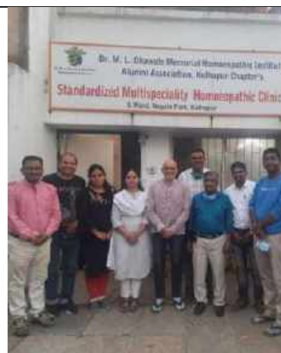
Group members at workshop