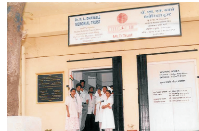
Mother and Child Care Hospital, Dahisar (PPP with MCGM)