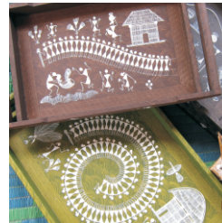
Promotion of Warli art

We work on the model of positive health, which is not mere absence of disease but a vibrant sense of well-being. This has led to a realization that a hungry person cannot be helped by medicines alone, however powerful. He needs work and his denuded land needs the healing touch of Organic Farming. The Trust has Organic Farming initiative, Sustainable livelihood programmes and Self Help Groups to improve the economic health of people. The Trust works with schools to enhance the education level in Bhopoli and Palghar.