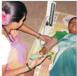
Community Health Volunteer (CHV)