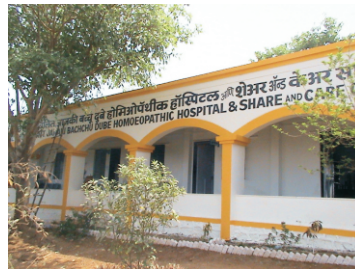
Community Health Centre, Bhopoli