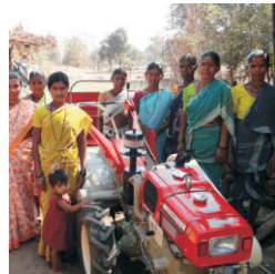
Self Help Groups