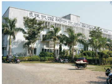
Rural Homoeopathic Hospital, Palghar