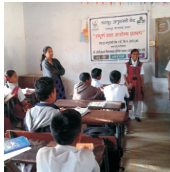
School Health Programmes