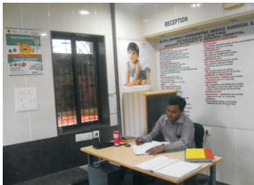
Medico-Surgical and Research Centre, Malad